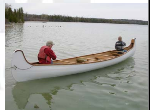
Our 26' Voyageur canoe, completed this month. It floats! This canoe is representative of large trading canoes that plied the Great Lakes in the 1600's.